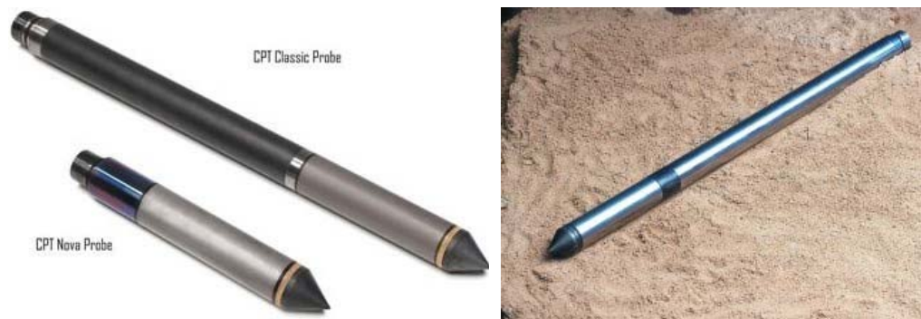
Figure 4: Common CPT probes ( www.geotech.se and www.envi.se )

A rough estimate of the number of CPT systems in Sweden is about 100 to 200. The use of CPTU varies in different parts of the country, depending on soil type in the region in question. In the areas with soft clay (e.g the western part of Sweden), CPTU is nearly always used, i.e. in 90 – 100% of the site investigation programmes. In the eastern part of Sweden CPT is used in about 50 – 80% of the large site investigation programmes, e.g. for roads and railroads and in less extent, about 20%, in smaller site investigation programmes, e.g. for buildings. In regions where till cover large areas the CPTU is used to less extent, i.e. in 20 – 30% of the investigation programmes. The CPTU is nearly always used, i.e. it is normal always to measure pore pressure together with tip resistance and sleeve friction.