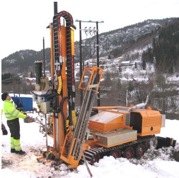
Figure 3: Typical site investigation rig.

In Denmark the number of CPT systems is about 13 to 14 in total. In Western Denmark about 10-15 % of the larger site investigations (>10-20 boreholes) make use of the CPT, the percentage is slowly increasing. In Eastern Denmark less than 2 % of the larger investigations make use of the CPT. CPTU is most often/always used as it is common always to measure pore pressure. Offshore, CPTU is always used.