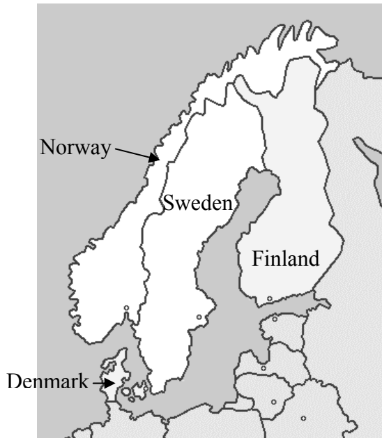
Figure 1: Map of the Nordic countries included in this report ( www.luventicus.org ).

lands in Denmark and in the southern part of Sweden and Norway, as well as the archipelagos of Norway, Sweden and Finland. About 25 million people live in the Nordic countries. The dominating languages are the Nordic languages and Finnish. The Nordic languages are Swedish, Danish, Norwegian, Faroese and Icelandic, which all have a common origin in the Old Norse.