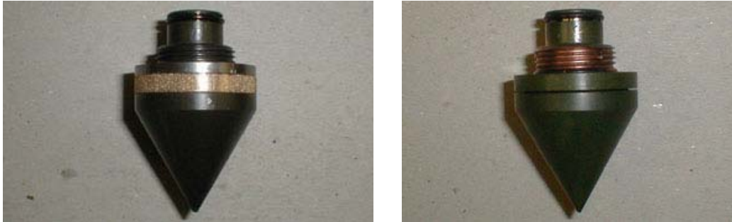
Figure 5: CPT tip with porous filter and slot filter respectively ( www.envi.se )

In Sweden, as well, there is sometimes a lack of competence and knowledge of the method by drillers and a lack of knowledge by engineers; as how to control accuracy demands, potential and limitations of the method e.g. in evaluation of parameters. These are all challenges to be dealt with. Finally, CPTU research in Sweden, especially concerning interpretation of parameters from CPTU in Swedish fine-grained soils has very much been the work of one person. It is a challenge to broaden the knowledge and get others to learn from his experience and continue the development work. These last challenges are currently addressed by arranging CPT courses both for drillers and engineers.